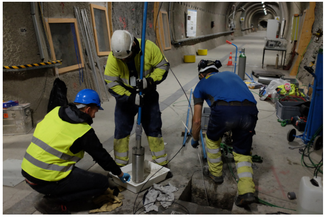
Figure 2: IC-A: The samples are below a packer and well stored.