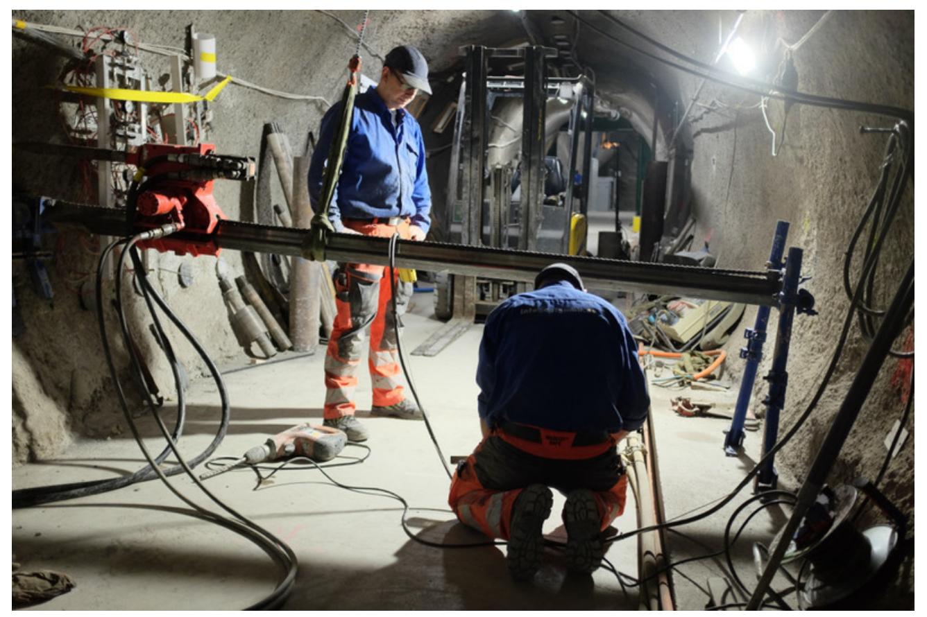
Figure 1: HE-E: Installation of the drill rig for HE-E4 inside Ga98.