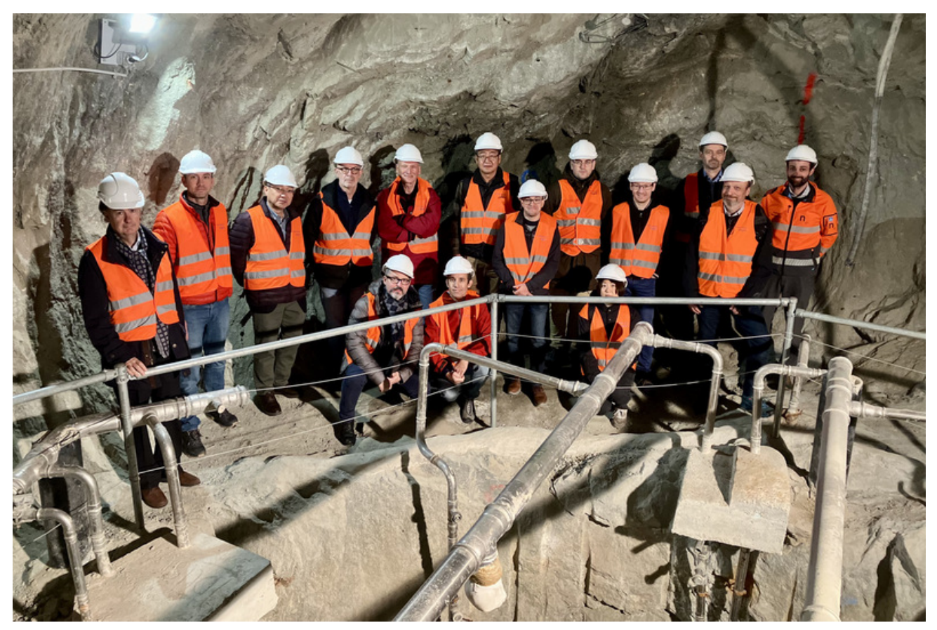
Figure 5: Varia: Part of the Mont Terri Delegates at Grimsel Testsite during Steering Meeting SM-93 (F. Kober, Nagra).