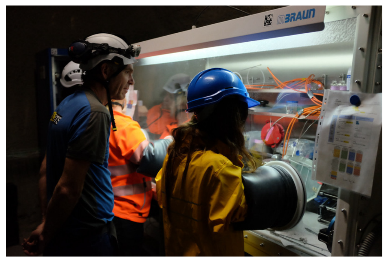
Figure 3: IC-A: Removing the samples in a controlled environment inside the glovebox.