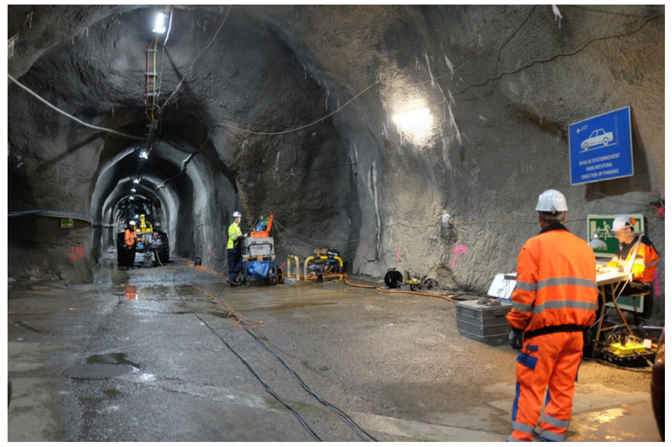
Figure 4: SI-B: Seismic measurements in the Safety Gallery (J. Windisch, swisstopo).