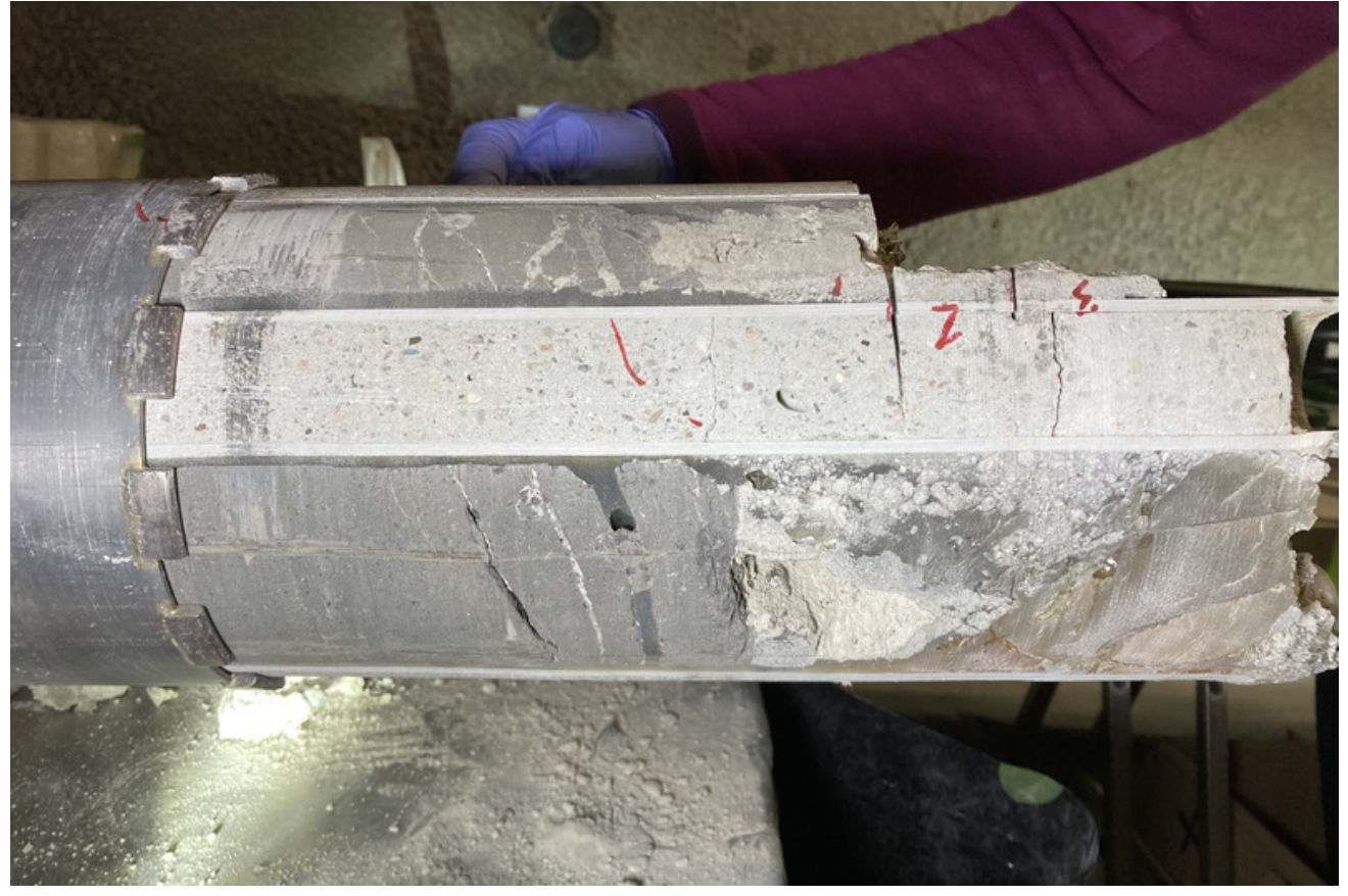
Figure 3: HE-E: Beautiful core from the interface between Opalinus Clay and bentonite close to the heater. The stabilizing drillings filled with resin are also visible.