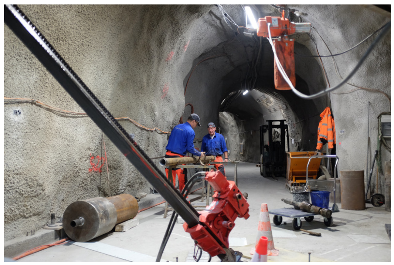
Figure 2: CI-D: Preparation of the core barrel for the overcoring.