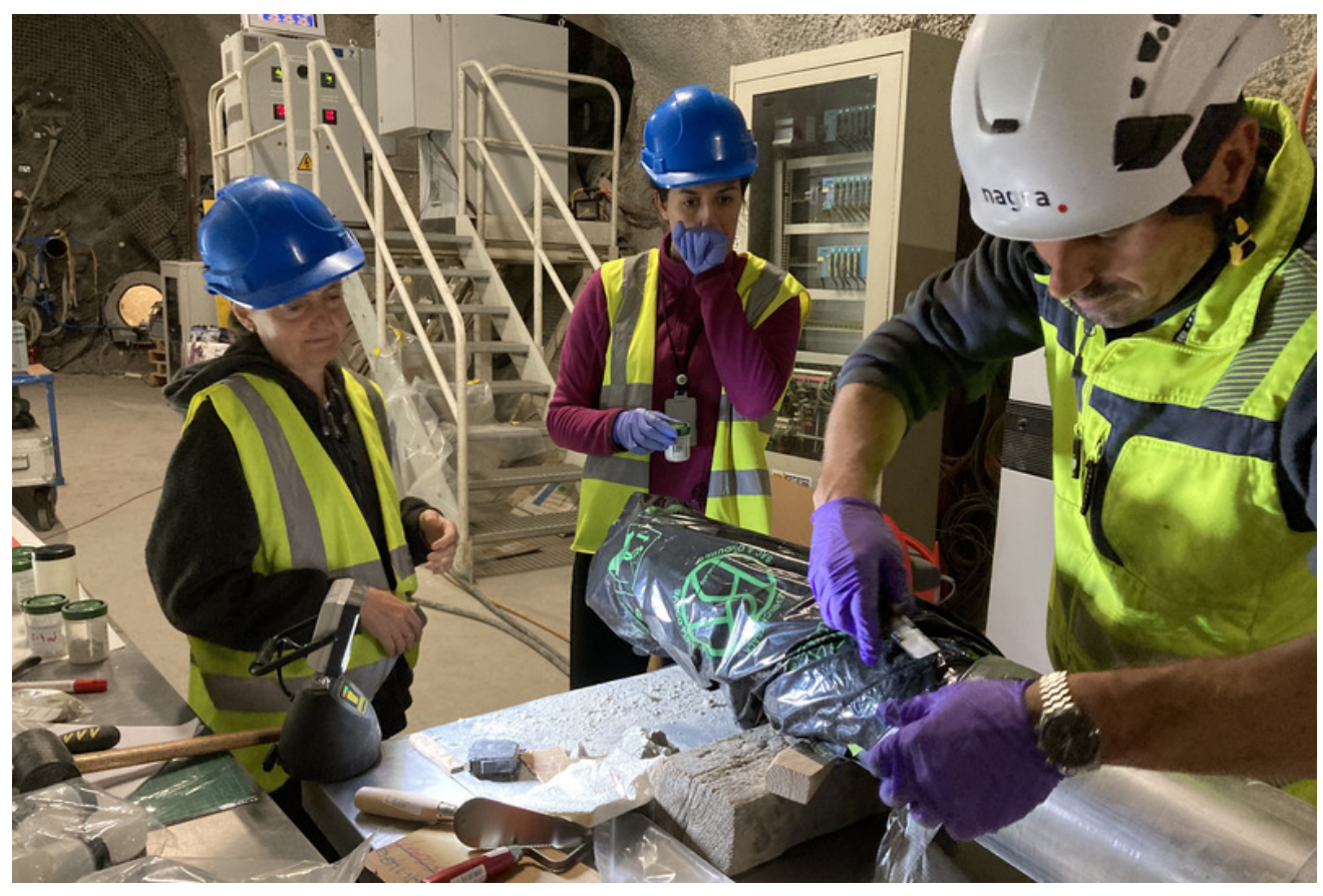
Figure 4: HE-E: Sampling from the overcored clay/bentonite interface.