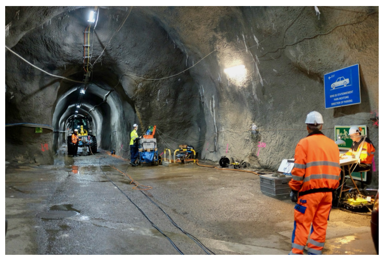
Figure 4: SI-B: The team from GFZ acquiring seismic data in the Safety Gallery.