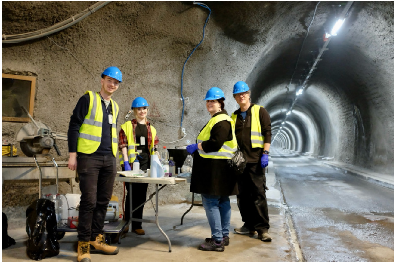
Figure 3: MA: