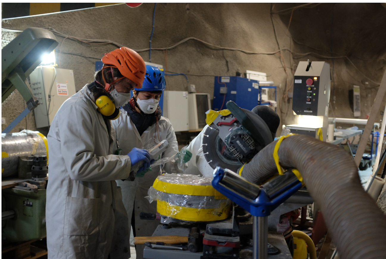
Figure 1: CI-D: Cutting the last pieces from one of the slabs.