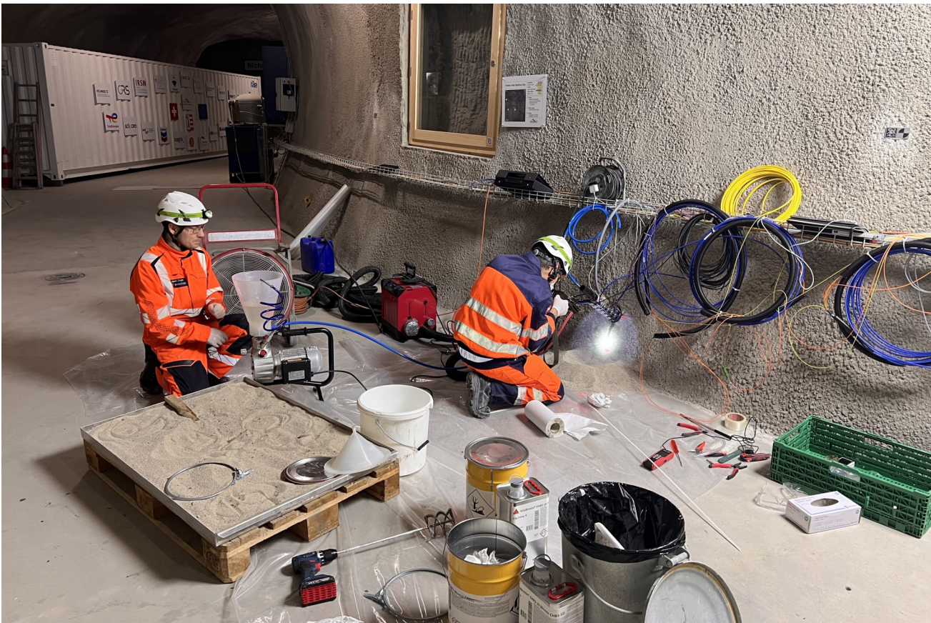
Figure 2: CL: Resin injection in BCL-3.