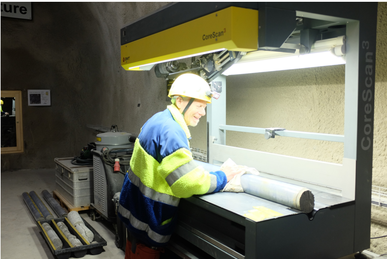
Figure 3: DM-A: Mapping also involves making well illuminated pictures from the drill core.