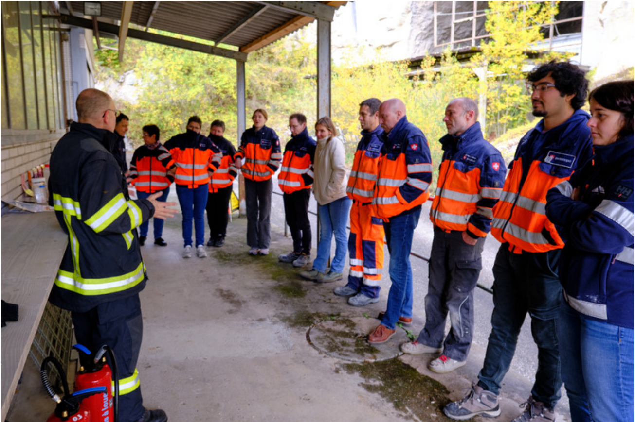
Figure 3: Varia: Theoretical instructions before the action started.