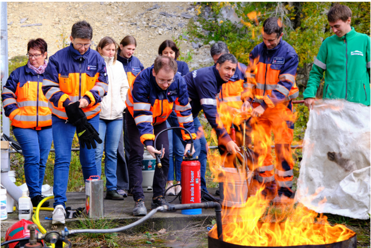
Figure 4: Varia: And finally some action! Very well prepared and totally safe, of course.