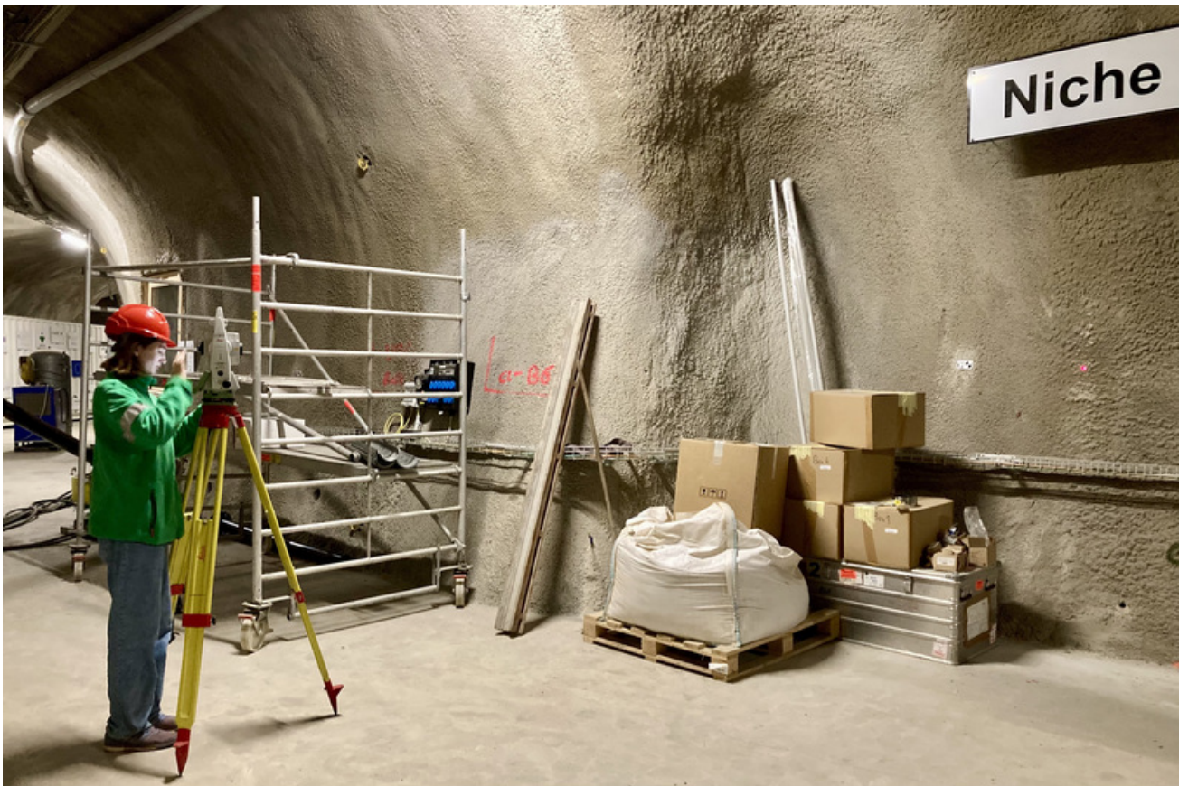
Figure 2: CL: Janna learned how to implement drilling positions as one of many things during her stay in Mont Terri. It was very nice having you with us.