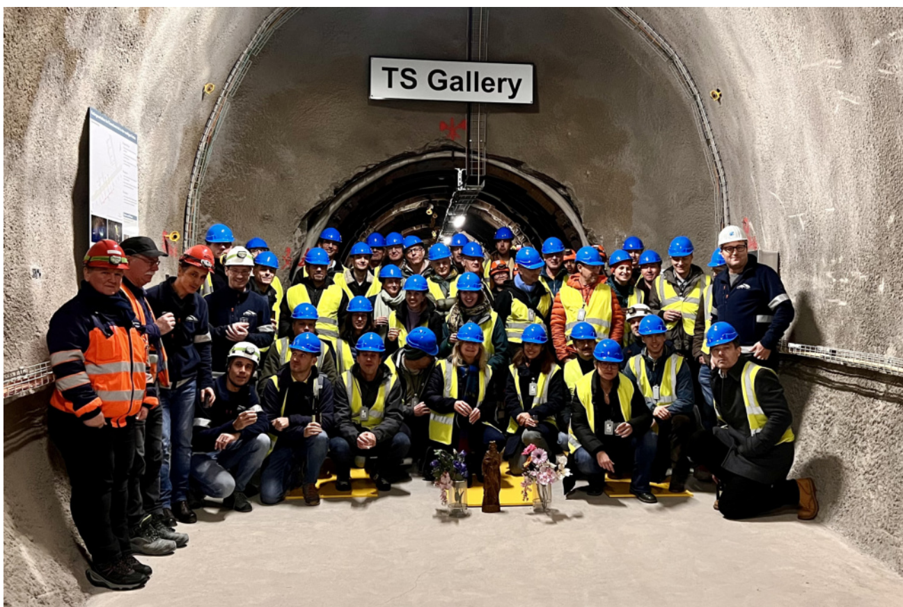
Figure 4: Varia: The smiling team of the Swiss geological survey.