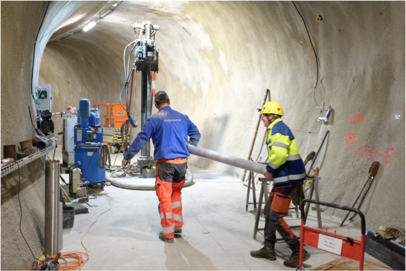
Figure 1: DM-A: Another core is ready for mapping and sampling (J. Windisch, swisstopo).