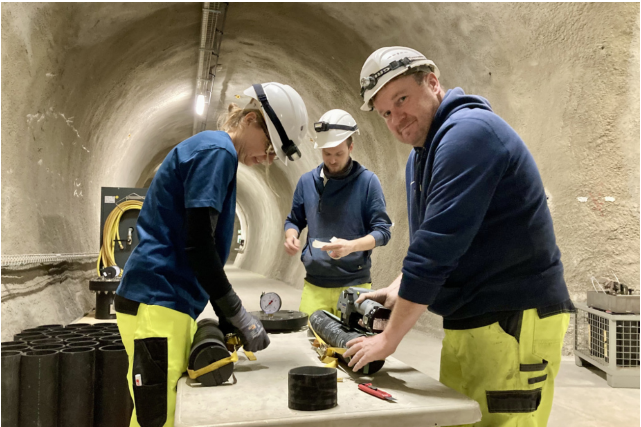
Figure 2: DM-A: The team from GRS during sample preparation (S. Schefer, swisstopo).