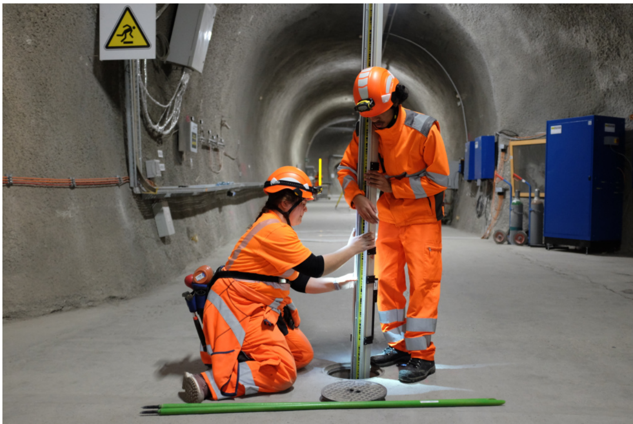
Figure 3: MH: Leveling inside Ga08.