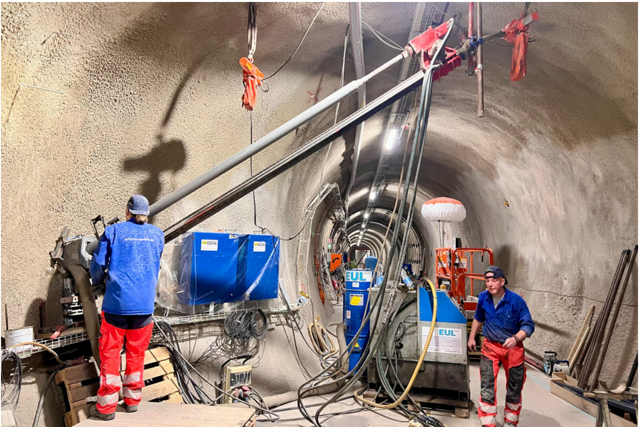
Figure 2: CL: The drilling of BCL-6.