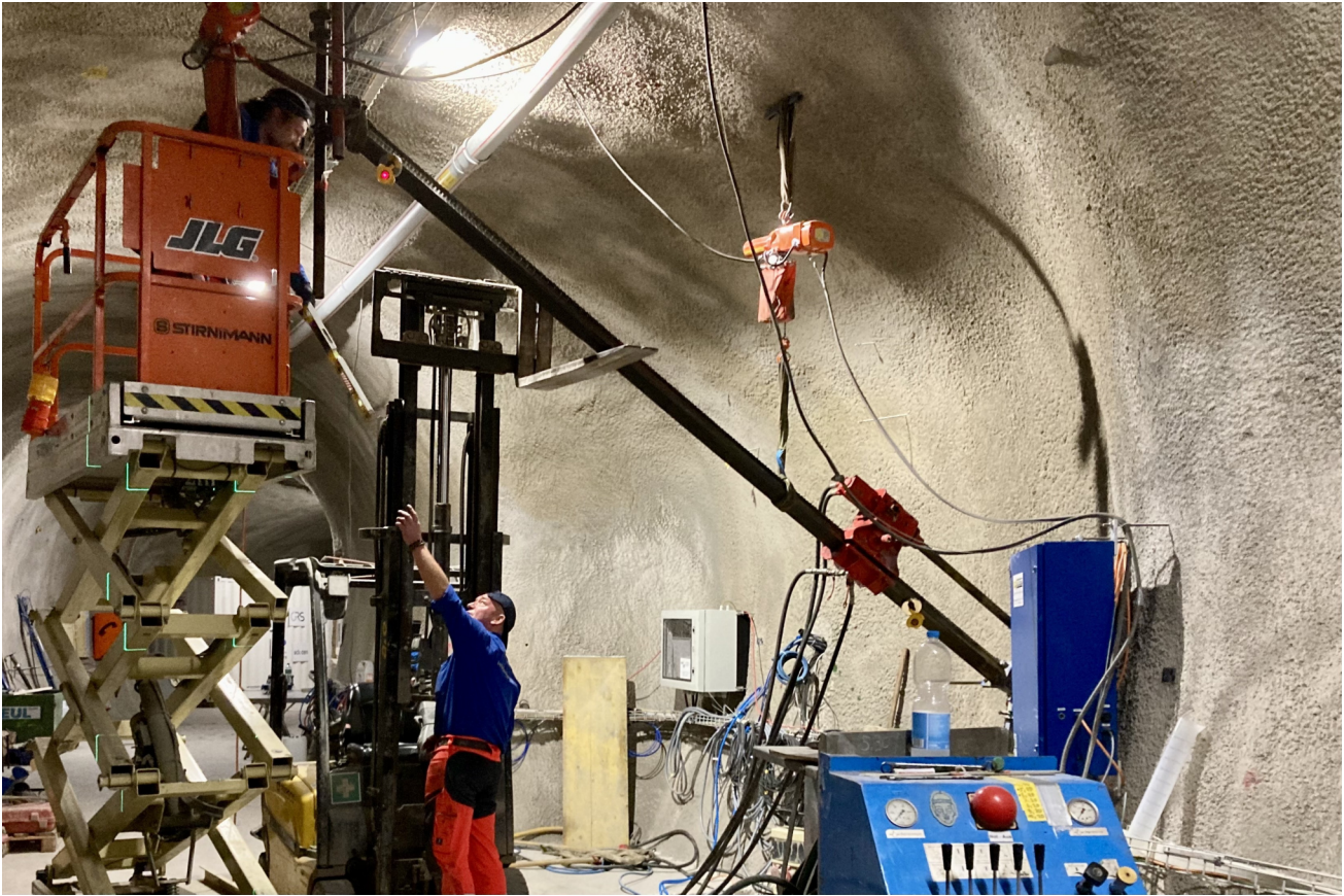
Figure 1: CL: The "hovering" drill rig for BCL-6, fixed on the ceiling.