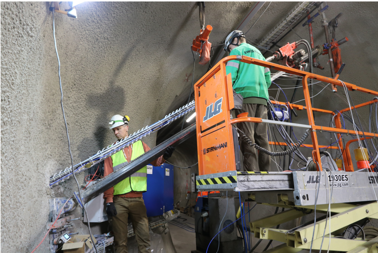
Figure 2: CL: Installation of the last MMMS into BCL-6 by the ZHAW/swisstopo team (M. Ziegler, swisstopo).