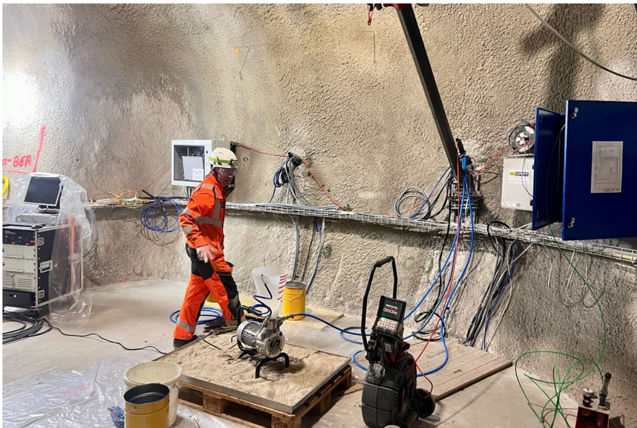
Figure 4: CL: Resin injection in the CL niche (J. Windisch, swisstopo).