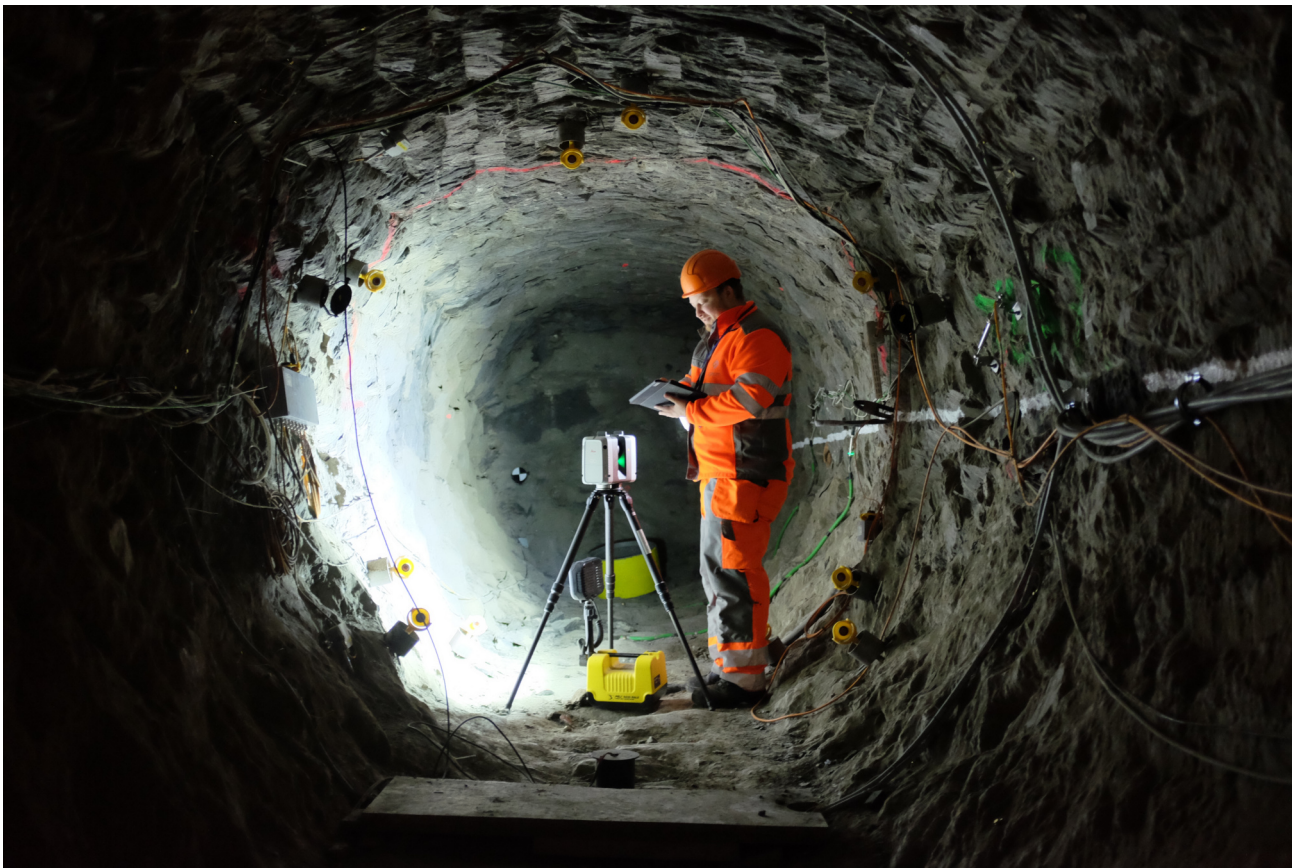
Figure 1: CD-A: Laser Scan inside Niche Closed Twin.