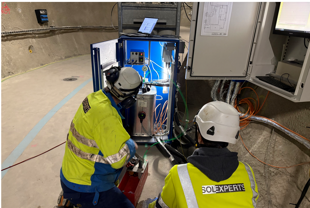
Figure 1: DR-C: Refill of the heating circuit.