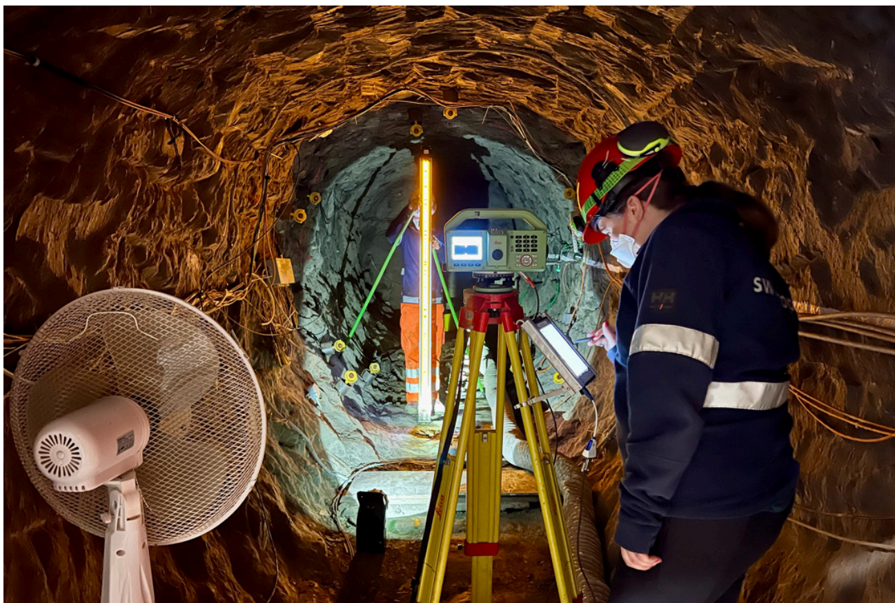
Figure 1: CD-A: Leveling in Niche Open Twin.