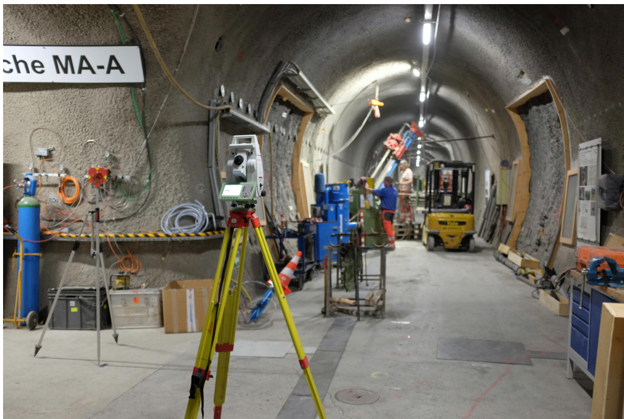
Figure 1: FS-B: Marking the position of BFS-B14 while the Eul team finishes BFS-B16.