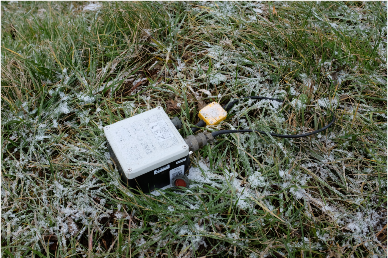
Figure 1: SI-C: A geophone in Outremont is shaken by the vibro-truck and stays ice cold... (S. Schefer, swisstopo).